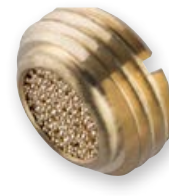
SINTERED BRONZE/BRASS SILENCER