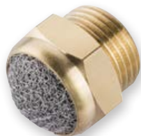
WIRE MESH/BRASS COMPACT SILENCER