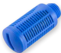
PLASTIC HIGH FLOW SILENCER