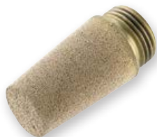
SINTERED BRONZE SILENCER