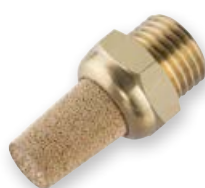
SINTERED BRONZE/BRASS SILENCER